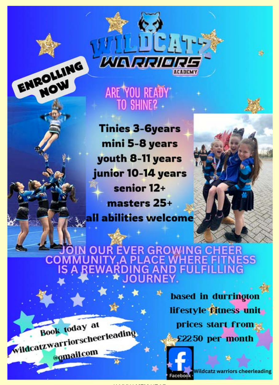
HAPPY NEW YEAR

WE ARE KICKING 2025 OFF WITH A BANG! WE ARE RECRUITING ATHLETES IN OUR TEAMS AND WE WOULD LOVE TO HELP KICKSTART YOUR 2025.