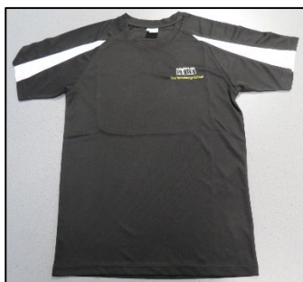
Performance PE Top (branded item)