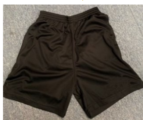
PE Shorts Plain Black

Buy from high street shops or supermarkets